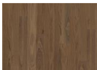
Pure Walnut Wide