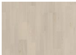
Coconut Cream 2-strip