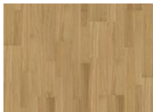
Pure Oak 2-strip