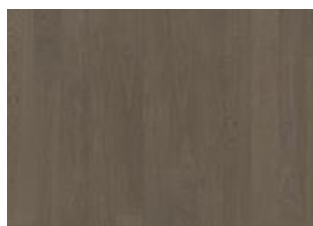
Faded Black Wide