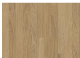
Light Suede Wide