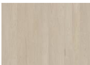
Coconut Cream Wide