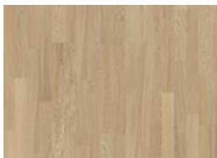
Whole Grain 2-strip