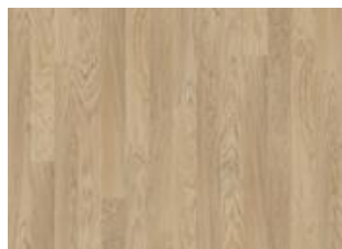
Whole Grain Narrow