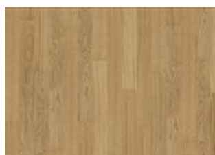
Pure Oak Narrow