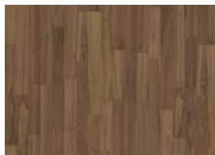
Pure Walnut 2-strip