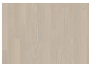
Coconut Cream Narrow