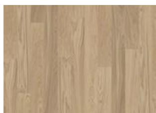
Whole Grain Wide